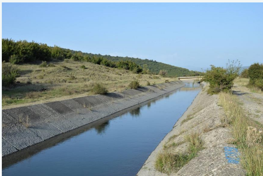
Example of an irrigation channel in Georgia

The implementation of the adaptation measure Irrigation systems in Agriculture has also positive effects on employment. Up to 10,000 additional people can be employed. This corresponds to an increase of up to 0.6 % in one year in the period under review (see Figure 1 ). Analogous to the effects mentioned above, this additional employment takes place in different economic sectors: on the one hand directly in the agricultural sector, but on the other hand also in the sectors for additional consumption and in the transportation sector. Since the model assumes an increasing productivity in the respective economic sectors, the additional employment decreases over time but remains clearly positive.